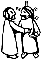
Peace be to you!